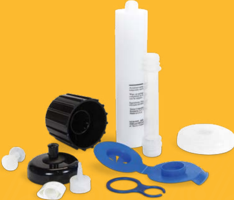
Injection Molding | 28