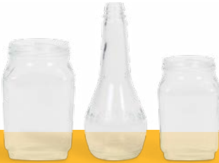
Glass | 20