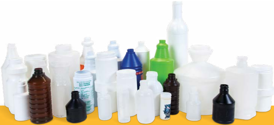
Cylinders and Rounds | 5