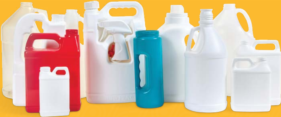
Handleware | 22