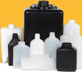
Oblongs and Squares | 33