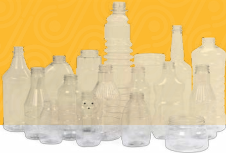
PET | 46