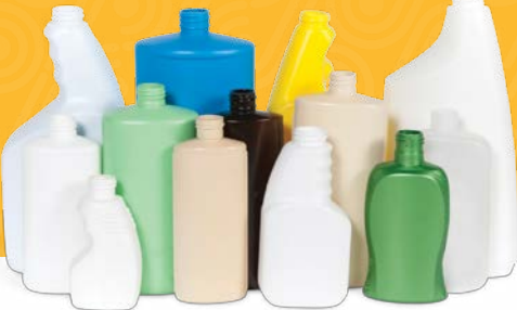
Ovals | 38