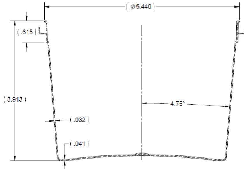
SECTION A-A SCALE 1 : 1