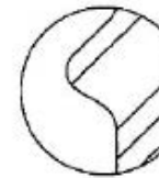
DETAIL B SCALE 6 : 1

THREAD DETAIL INFORMATION 6 THREADS PER INCH, 0.1667 PITCH,