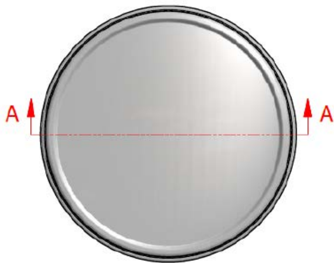
TOP SCALE 1 : 1